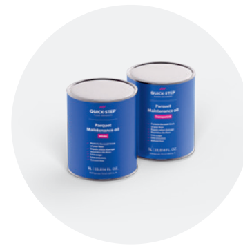
Maintenance oil 1 L QSWMAINTOILN / QSWMAINTOILW

Easily repair light damage and match the original colour of your floor with this kit. For detailed step-by-step instructions, visit quickstep.com .