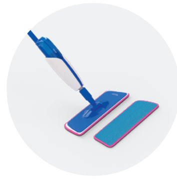
Cleaning kit QSSPRAYKIT

This cleaning product was specifically developed for Quick-Step floors. It cleans the surface thoroughly and safeguards its original appearance, maximising that 'new floor' experience.