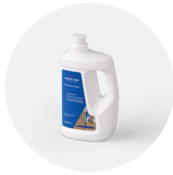
Cleaning product 1 L or 2.5 L QSCLEANING1000 QSCLEANING2500

This cleaning product was specifically developed for Quick-Step floors. It cleans the surface thoroughly and safeguards its original appearance, maximising that 'new floor' experience.