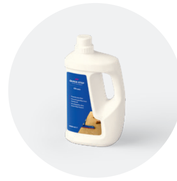
Oil care QSWOILCARE1000

The cleaning kit consists of a mop holder with a refillable water tank and handy lever to easily moisten and mop your floor. Also included: a washable microfiber mop and 1 L of Quick-Step Cleaning product. Now you can clean your floor swiftly and sustainably!